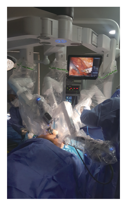
Figure 2 Instrument position for a RVATS pulmonary lobectomy with a three arm surgical technique. RVATS, robotic assisted videothoracoscopic surgery.

had chest tube drainage from 24 to 48 hours and length of hospital stay less than 48 hours, which concur with our results (3). Our results are comparable to those reported in the international literature, with the exception of sex distribution because our series has more females compared to others (10). Our total operative time is also comparable: the mean operative time in our study was 185 min and in the literature it ranges from 107 to 241 minutes (9,10). As we know, there is a steep learning curve for RVATS, and operating time has been shown to significantly improve after the initial learning period (23,24). In this report we analyzed the total operative time by the year in which the surgical procedures were performed and the mean total time decreased during the six years of the study (Figure 1). Conversion rates of 0% were reported in many series (25,26). Postoperative hospital LOS, duration of chest tube drainage, perioperative mortality, perioperative morbidity and blood loss in this series were comparable to those previously reported (9,10,27).