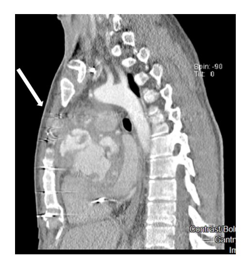
Figure 1 Multiplanar CT image of a giant false aneurysm arising from proximal anastomosis of valve graft conduit and extending to the posterior aspect of the sternum (white arrow).

ARR, aortic root replacement (all patients had Bentall procedures); AVR, aortic valve replacement; MVr, mitral valve repair; MVR, mitral valve replacement; PVR, pulmonary valve replacement; VDS, ventricular septal defect.