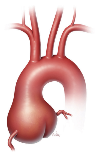
Figure 1 Illustration of annuloaortic ectasia, the distinctive aortic root dilatation that is commonly present in patients with Marfan syndrome. (Used with permission of Baylor College of Medicine.)

to the vessel as a site for cardiopulmonary bypass inflow. The patient was cooled to 30 °C, and the ascending aorta was cross-clamped proximal to the innominate artery. The aneurysm was opened at the sinotubular junction, the