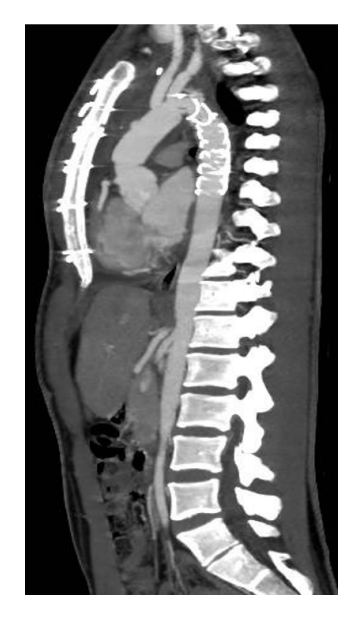
Figure 3 Postoperative CT angiogram showing normal morphology of the Thoraflex hybrid prosthesis and of the supraaortic trunks reimplantation.

then performed with a 4/0 polypropylene running suture with previous reinforcement of the proximal supracoronary ascending aorta with a double felt of heterologous pericardium. After careful deairing, the aortic clamp was removed and the myocardium reperfused. The arch reconstruction was carried out by means of left common carotid artery and innominate artery using the other two side branches of the hybrid prosthesis upon removal of ASCP cannula. When normothermia was reached, CPB was progressively weaned, with no need for inotropic support. The arterial and venous cannulae were removed and hemostasis was obtained. Finally, after positioning of drains and ventricular pacing wires, the pericardium was partially closed and the sternum resynthesized in a routine fashion.