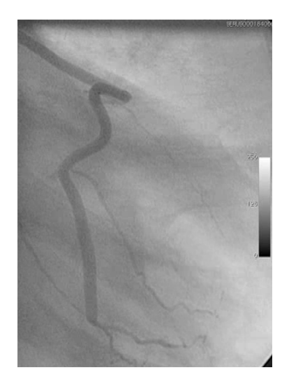
Figure 2 A sequential no-touch vein graft anastomosed to three small target vessels.

Annals of cardiothoracic surgery, Vol 7, No 5 September 2018