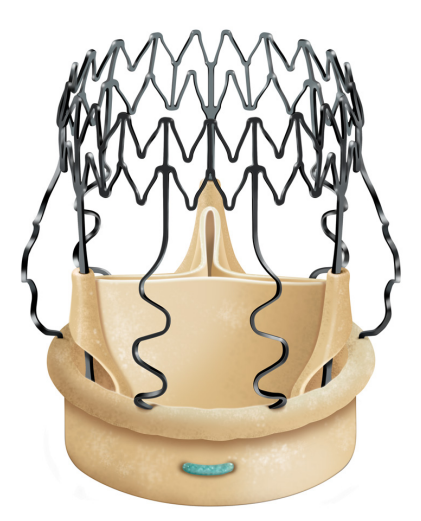
Figure 1 Perceval sutureless bioprosthesis.