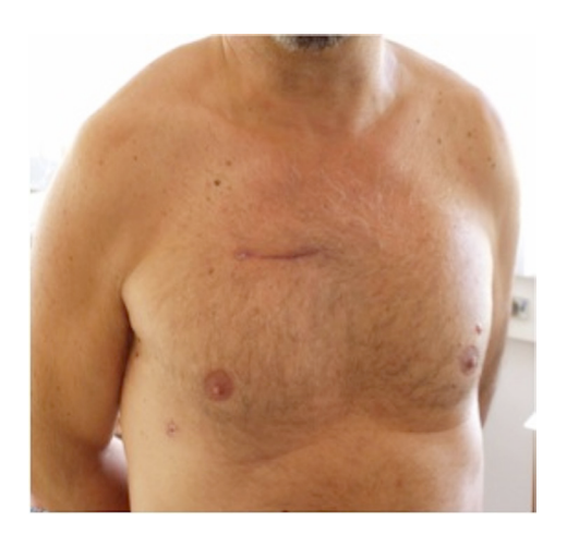
Figure 2 Result of a right anterior minithoracotomy approach.