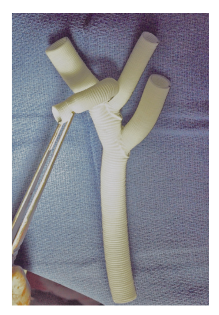
Figure 1 Intra-operative image of the modified 3-branched Dacron graft (TAPP, Vascutek Ltd., Renfrewshire, Scotland, UK). This graft has the advantage of having an additional limb (held by forceps) which allows for antegrade cerebral perfusion following completion of each branch anastomosis and removes the need for separate axillary cannulation to supply inflow to the graft

Annals of cardiothoracic surgery, Vol 2, No 2 March 2013