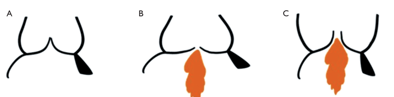
Figure 3 The relationship between aortic root geometry and aortic valve function. (A) Normal aortic root geometry results in good cusp coaptation, while (B) annular dilatation results in cusp prolapse and aortic insufficiency, and (C) sinotubular junction dilatation distracts the cusps and also induces aortic insufficiency.

the aortic cusps, and reduces coaptation areas from 27% with an annulus of 20 mm, to 2.8% with an annulus of 30 mm (20).