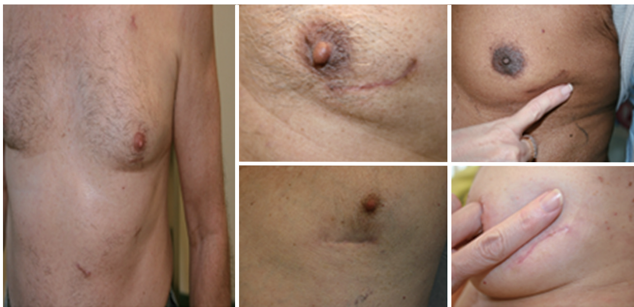
Figure 1 Minimal scars following robotic-assisted CABG procedures. CABG, coronary artery bypass grafting.

length of stay. R-MIDCAB is the collective term for CABG procedures performed through small incisions as an alternative to median sternotomy. Harvesting the IMA robotically, operating on a beating heart, and performing anastomoses through a small incision all require advanced training and incremental learning. Increased experience generally leads to shortened surgical times and fewer complications (3,4). R-MIDCAB is a challenging procedure, which requires a dedicated surgical team to start this journey. This paper aims to describe the distinct steps and components necessary for teaching R-MIDCAB. It also provides a general overview of the surgical robotic setup and ways to troubleshoot potential complications that will lead to successful surgical outcomes.