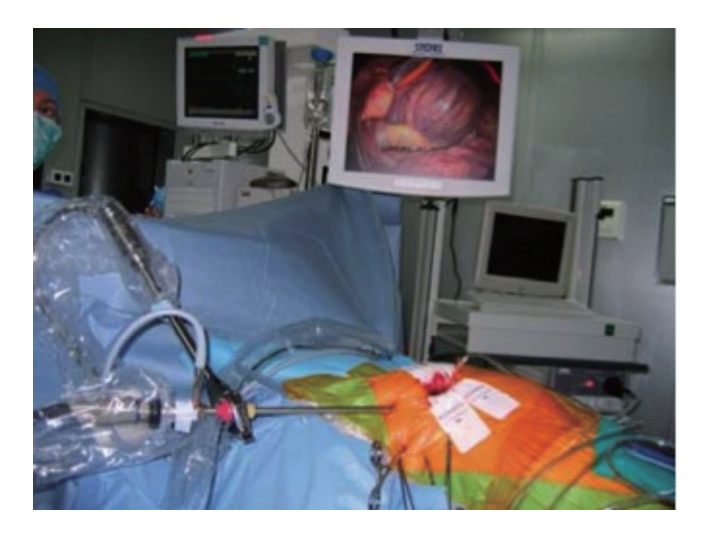
Figure 3 Antero-lateral right minithoracotomy (3-5 cm) through the fourth intercostal space.

Given that the only venous cannulation complication was an arterio-venous fistula at the beginning of our experience, we now avoid the puncture of both vessels on the same side.