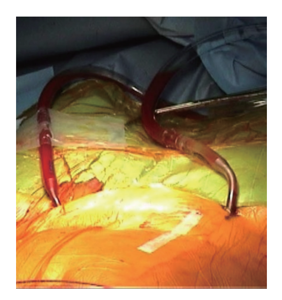
Figure 2 Total percutaneous femoral vessels cannulation technique with the arterial cannula on the left side of the patient and the venous cannula on the right side.

to mitral valve repair (93%), mitral stenosis or non dystrophic mitral regurgitation leading to mitral valve replacement (7%).