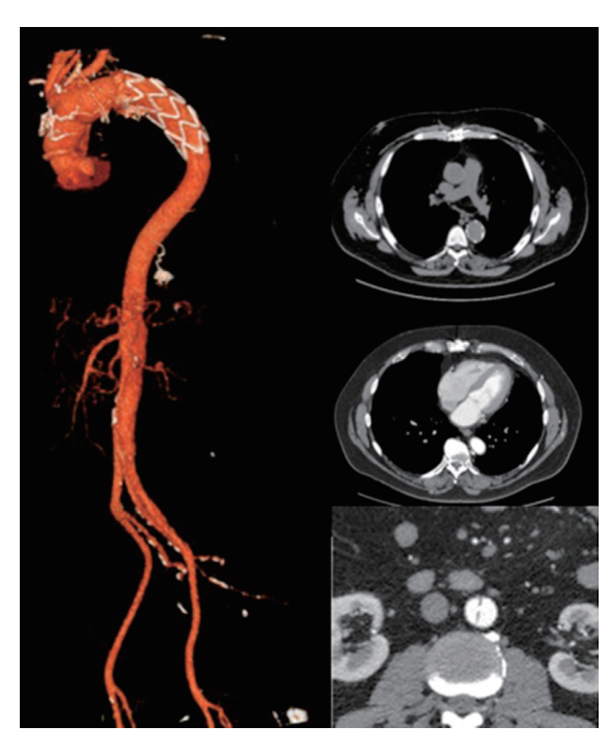
Figure 2 At 4-year follow-up, imaging via CT angiography showed complete remodeling of the descending thoracic aorta. Aortic remodeling did not occur at the abdominal aorta due to a wide reentry located at the renal arteries. CT, computed tomography.

The post-operative course was uneventful. The patient was discharged on post-operative day 10 with CT angiogram showing complete thrombosis of false lumen in the descending thoracic aorta. At 4-year follow-up, CT