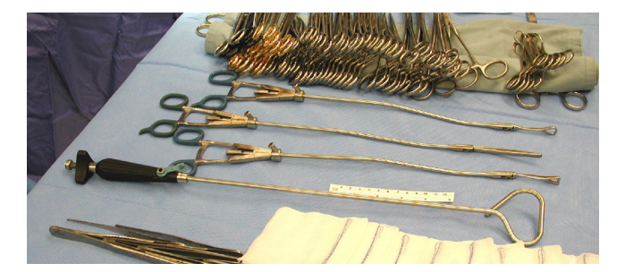
Figure 4 Adjustable laparoscopic liver retractors that can be positioned around the bronchus to facilitate specimen retraction for division of the bronchus. (Cardinal Health, Dublin, OH)

With larger tumors and difficult anatomic dissections, having proper traction and counter-traction on structures is of paramount importance. Usually when difficulty arises during a dissection, one can find inadequate retraction angles to be the source of trouble. Proper retraction angles to facilitate safe dissection are now easier to create, and quickly adjust, with newer low profile 5 mm round shaft thoracoscopic instruments (Figure 3). Another concern regarding thoracoscopic approaches for technically difficult cases is that increased operative time, with prolonged general anesthesia, will prove detrimental to the patient and negate any proposed benefits of a thoracoscopic approach. In our previously reported data for VATS lobectomies for locally advanced NSCLC, median operative time for the thoracoscopic group was 231 minutes (96-574), compared to 202 minutes for the open group (105-317) (12). We feel these operative times are not unreasonable. Previous concerns regarding the duration of general anesthesia exposure and its impact on patient results may not be as relevant if the operation can be completed with VATS. For instance, increased resources like extended operative times with thoracoscopy may be justified if avoiding thoracotomy in a frail patient reduces the need for prolonged convalescence.