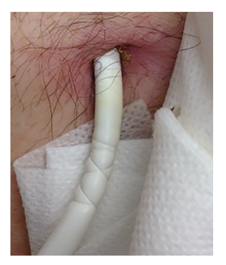
Figure 1 Early technique of securing driveline. Prolene anchoring suture resulted in significant driveline crimping that persisted, even after removal of the stitch.

The implications of a driveline infection necessitate a focused approach to driveline management from the time of surgery until well after discharge. For patients who present with a driveline infection, early recognition and treatment is important. Many institutions have evolved new surgical techniques for LVAD implantation as well as specialized postoperative management of the driveline. In this paper, we describe the evolution of our multidisciplinary approach for minimizing and treating driveline infections at the University of Virginia ( Video 1 ).