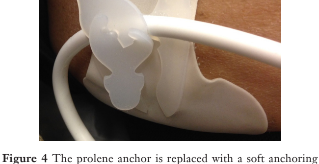
Figure 4 The prolene anchor is replaced with a soft anchoring device at one month postoperatively.

Figure 3 Driveline management system (left) and daily exit site management protocol (right) provide a standardized routine for driveline management.