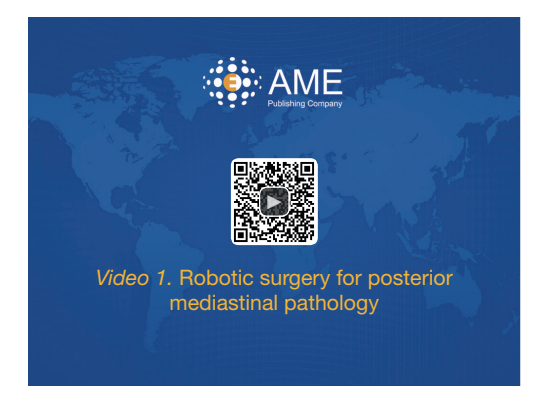
Video 1 Robotic surgery for posterior mediastinal pathology. Available online: http://www.annalscts.com/article/view/7252/9665

arm No.1, and robotic arm No.2 is 9 cm from robotic arm No.1 (most anterior). An assistant port is triangulated behind robotic arm No.2 (the left arm) and the camera port, as low in the chest as possible without disrupting the diaphragm. The camera port is placed initially, which permits carbon dioxide insufflation of the left chest to 15 mmHg. Once all ports are placed, the robot is docked. A cadiere instrument is used for the left robotic arm and a curved bipolar dissector is used for the right robotic arm. A thoracic grasper is used for robotic arm #3, and can assist with retraction of the lung or the mass.