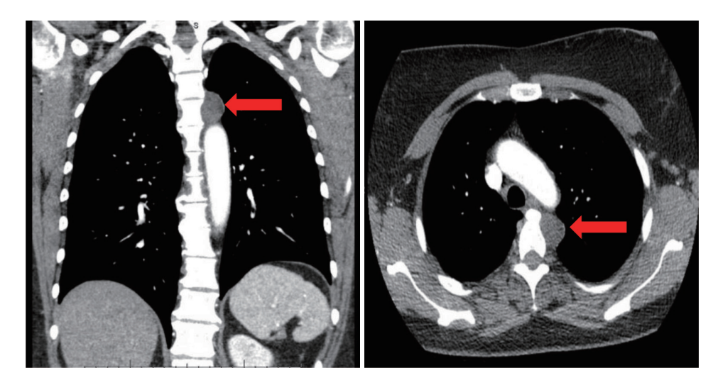
Figure 1 Coronal and axial views of posterior mediastinal mass. The mass was 2.4 cm by 2 cm at the fourth thoracic vertebral level.