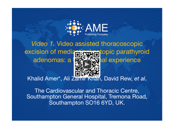
Figure 2 Video assisted thoracoscopic excision of mediastinal ectopic parathyroid adenomas: a UK regional experience (10). Available online: http://www.asvide.com/articles/721

Intravenous methylene blue (MB) at a dose of 0.5 mg/kg body weight in a 500 mL bag of 5% dextrose/saline was started intravenously at induction of anesthesia and finished just before exploration ( Figures 1,2 ) (10). MEPAs preferentially took up the dye and were made easily