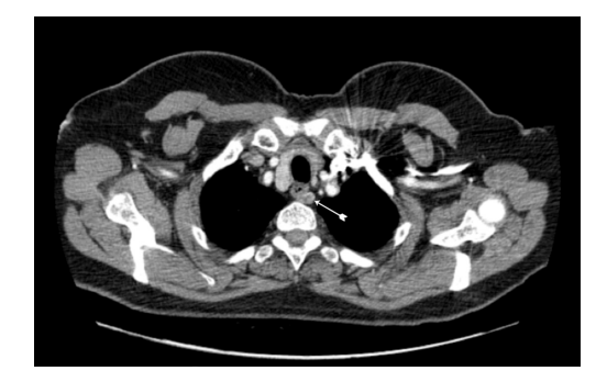
Figure 3 Superior mediastinal mediastinal ectopic parathyroid adenoma (MEPA) in a left para-esophageal location, at the level of vena cava, azygos vein, and higher than origin of left subclavian artery, approached successfully by cervical exploration.

Until recently, bilateral neck exploration was the gold standard operation for primary hyperparathyroidism, without localisation imaging. The Scholz-Purnell report from the Mayo Clinic in 1971 and the Kaiser report by Rubinoff in 1983 concluded that: "our recommendation for patients whose clinical and laboratory studies support the diagnosis of primary hyperparathyroidism has been and continues to be surgical exploration by an experienced parathyroid surgeon." There is general agreement that an experienced parathyroid surgeon should perform a minimum of nine to ten explorations annually (16,17). Bilateral neck exploration aims at identifying all four parathyroid glands and removing all abnormal parathyroid tissue. Despite a high cure rate approaching 70%, neck exploration is related to failure, morbidities and difficult second surgeries, not to mention the large unsightly incision. Edis et al. suggested that the main reason for failed exploration is "failure on the part of the surgeon to appreciate the nuances and variations of normal parathyroid anatomy" (18). This trend is retracting, as precise preoperative localisation studies and intraoperative PTH monitoring coupled with the advent of keyhole surgery (VATS) have managed to improve cure