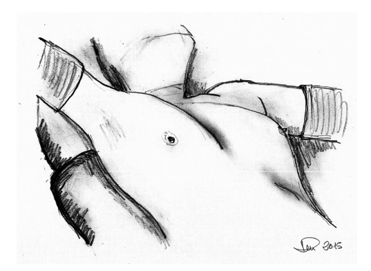
Figure 1 Patient position.