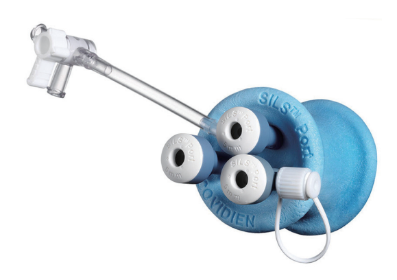
Figure 2 The Single Incision Laparoscopic Surgery (SILS) Port device.