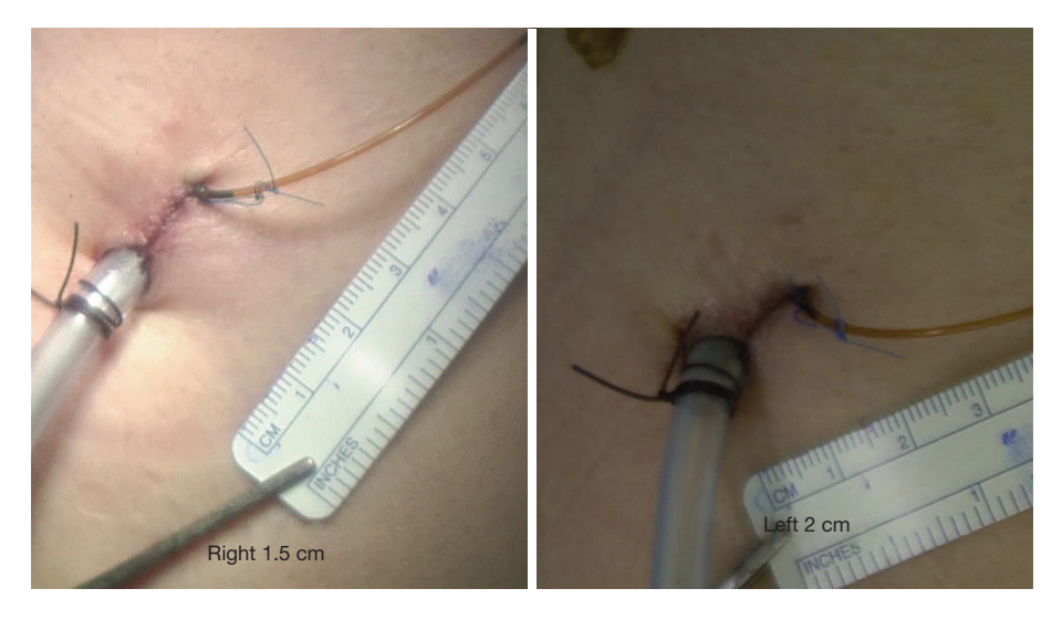
Figure 3 Postoperative wound.

than 300 uniportal VATS major lung resections and 30 of these patients underwent VATS segmentectomy using a uniportal approach. Our indications for uniportal segmentectomy were early lung malignancy (peripheral cT1N0) with a tumor less than 2 cm in diameter and a GGL that was less than 50% solid (1). Pulmonary segmentectomy carried out in patients not suitable for wedge resection and those with inflammatory lung disease in order to preserve pulmonary reserve was also included in our series. Of the 30 cases of uniportal segmentectomy, 21 (70%) cases had lung malignancy with a mean tumor size of 1.6\pm0.5 cm (range, 0.9–2.7 cm). The mean operation time was 147.2±59.3 minutes (range, 30-236 minutes). Preoperative localization was successful in 14 (73.7%) patients. There was one case of conversion to lobectomy in a patient who had not undergone preoperative localization, because we failed to find the lesion after segmentectomy. There was no lymph node metastasis in any patient upon pathologic examination. There was one case of prolonged air leak (>5 days) and two patients had postoperative pneumonia; they recovered with conservative management. There was one early mortality (<30 days) due to septic shock developing after systemic arterial embolism due to underlying disease. The mean chest tube indwelling time was 4.6±1.6 days.