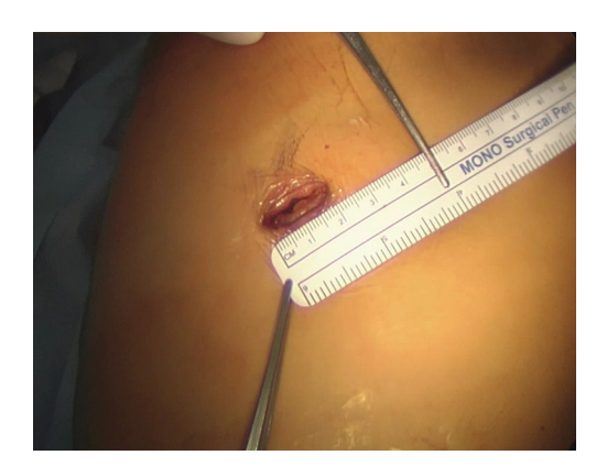
Figure 2 Incision for uniportal video-assisted thoracoscopic surgery (VATS) segmentectomy.

fifth intercostal space, along the anterior axillary line. Thoracoscopic exploration revealed the hook-wire from the pleura localized to the target lung lesion. Dislodgment of the hook-wire is a common event in preoperative localization. Therefore, the advantage of dual localization with a radiopaque contrast media such as barium or lipiodol is a higher detection rate of lung lesions in the case of hookwire dislodgement. The dual localization technique also benefits from correct localization of the target lung lesion with a hook-wire from the pleural surface by thoracoscopy and a sufficient resection margin of more than 2 cm from the lesion with lipiodol and guidance using real-time C-arm fluoroscopy. After insertion of an intrapleural continuous analgesia infusion system and a 16-French chest drain at the